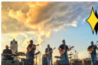
Almond Butter Band | 10.21 | 9:30PM