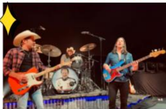
The Swayback Nags | 10.21 | 7:30PM