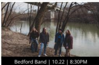
Bedford Band | 10.22 | 8:30PM