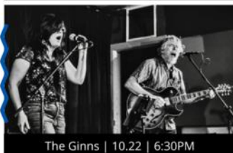
The Ginns | 10.22 | 6:30PM